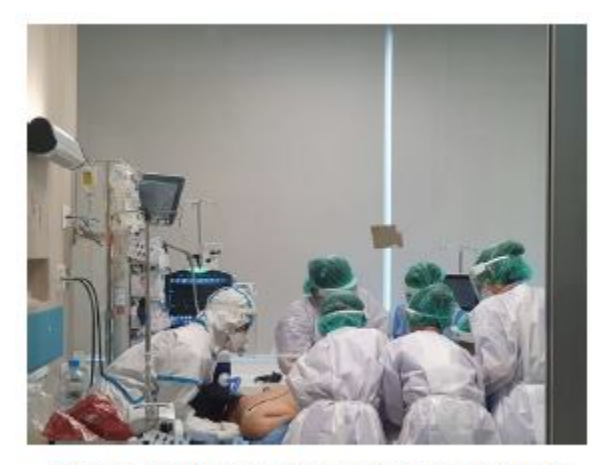
Figure 5: performing prone position in this patient

the nursing team to perform the prone position, the caring of the femoral cannula and the CRRT during prone was somewhat challenging.