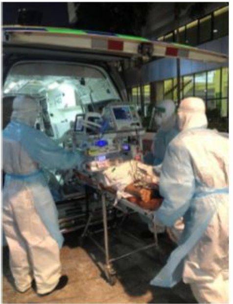
Figure 3: The transfer of our first COVID-19 ARDS patient. We need to wear PPE at all times and care must be taken to prevent the air tubing from disconnection.