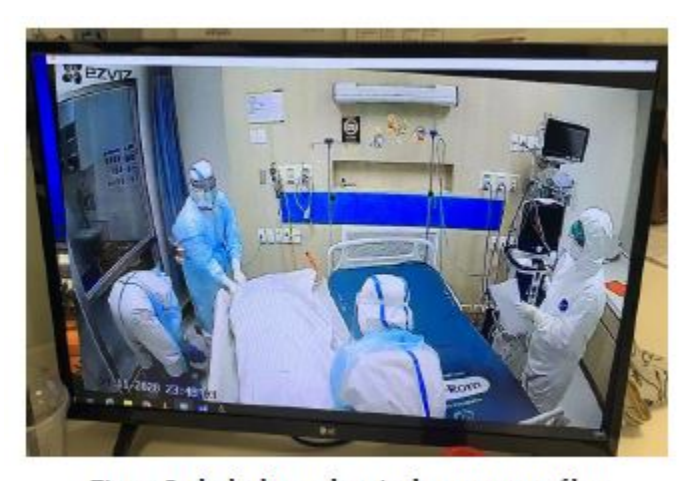
Figure 7: the body was kept in the water-proof bag

Finally, we couldn't overcome the fate. I was a witness, standing there watching the lifeless body of the sick being packed through the surveillance camera. Her body was packed in a water-proof bag to prevent the spread of the disease and no one would have a chance to see her again. During my doctor life I've experienced many deaths, but this time it was different. It's the most solitary death I've ever seen. Even with sorrow, it was once-in-a-lifetime experience for me where I saw a full journey of a COVID-19 victim, from the first diagnosis to the last day of life.