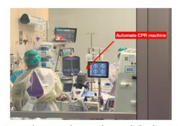
Figure 6: the automated CPR machine attached to the patient

She seemed to need more time to cope with this extremely bad news and asked us to perform full CPR if needed. Although we knew that there would be no hope for her mother, we decided to attach the automatic CPR machine in case of emergency and planned to allow her to visit her mom for the last time. This would involve transferring her daughter to the ICU and the need to prepare more works for infection controls. If you were me, what would you do?