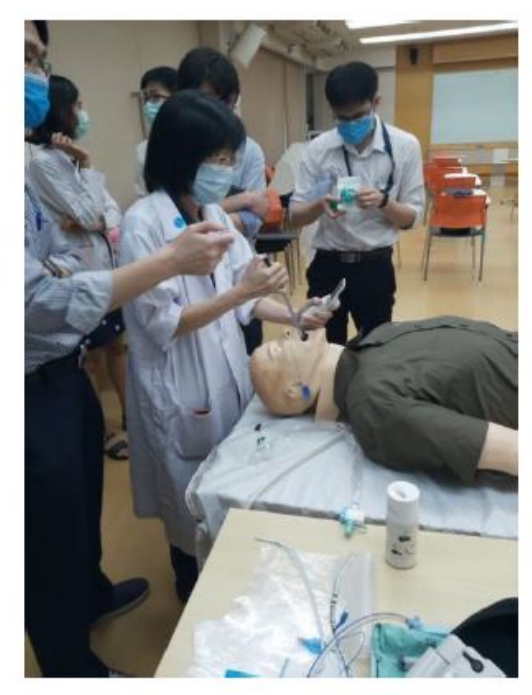
Figure 2: Practicing essential procedures needed for protection of the spread.

Even with all of those being done in advance, when we had our first ARDS patient from COVID-19, there were lots of difficulties. We needed to keep the balance between close monitoring and personnel protection during the care of the case and especially during the transfer of the patient to CNMI. With this first ARDS case, I was assigned to take care of this patient and accommodated him during